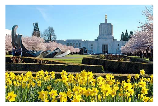
Area: 1,194 sq. miles Population (2018): 344,035 County Seat: Salem Average Temp.: January 40°, July 67°

The county, located in the heart of the Willamette Valley, has the Willamette River as its western boundary and the Cascade Range on the east. Marion County has 20 incorporated cities, including the Sate Capital, Salem.