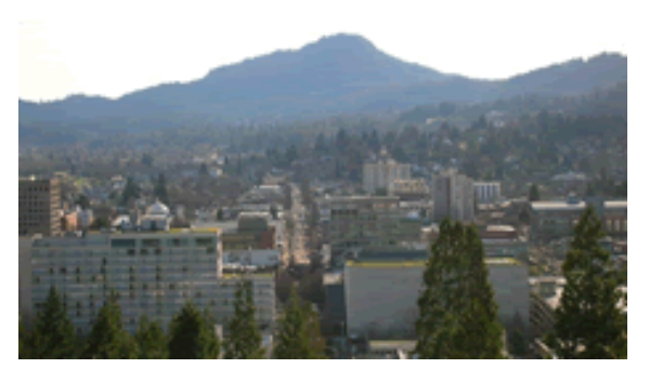
Area: 44 sq. miles Population (2018): 169,695 Avg. Summer High Temp.: 79° Avg. Winter Low Temp.: 36°

Eugene is located at the south end of the Willamette Valley, at the confluence of the McKenzie and Willamette rivers. Eugene has the third largest metropolitan population in the State.