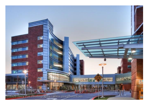
New Patient-Care Tower

Salem Health Hospitals & Clinics, the largest private employer in Salem, is a local, not-forprofit, tax exempt health system—created by and for the people of the mid-Willamette Valley governed locally by a volunteer 15-member Board of Trustees. Salem Health provides a broad scope of health care in addition to traditional acute-care hospital services.