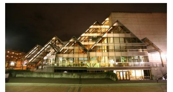
arts or shop at the Saturday Market, a weekly, open-air market featuring local artisans, performers, and international food. For athletic or outdoor pursuits, Eugene has walking, jogging, and bicycling facilities to accommodate any preference or ability and easy access to mountain and coastal recreation areas.

Whether you are looking for outdoor adventure or a quiet corner in the city's beautiful new library, Broadway productions or home-spun repertory theater or a peaceful sense of community, Eugene has it all. The Hult Center presents performing